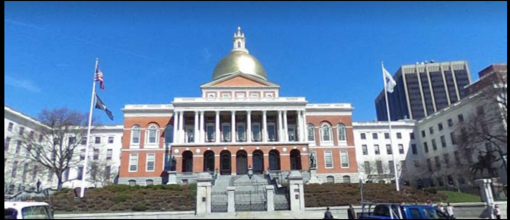
Beacon Hill, Boston, MA

“It was the best of times, it was the worst of times, it was the age of wisdom, it was the age of foolishness, it was the epoch of belief, it was the epoch of incredulity, it was the season of Light,