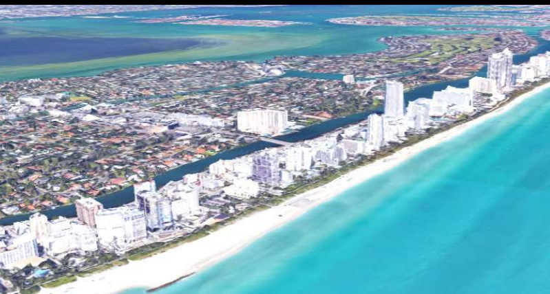
Miami Beach, FL

it was the season of Darkness, it was the spring of hope, it was the winter of despair, we had everything before us, we had nothing before us, we were all going direct to Heaven, we were all going direct the other way...”